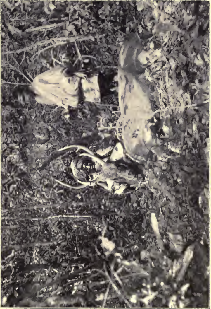
“ THE MAIOUT WAS HOLDING UP THE HEAD. ”